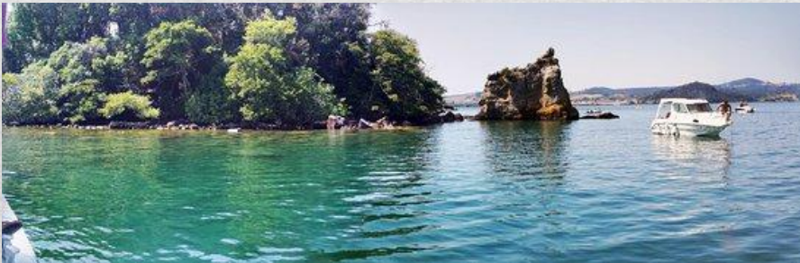
Bisentina Island, Bolsena lake

Alternatively you can choose to relax at the castle and take advantage of the swimming pool, tennis court, indoor and outdoor games . Have a massage or take a cooking class.