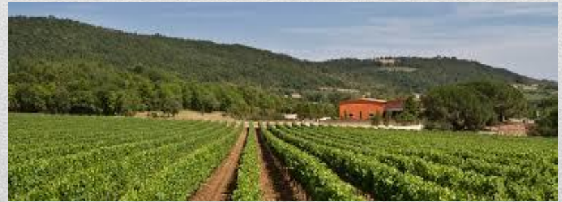
Sorano Wine tasting Antinori